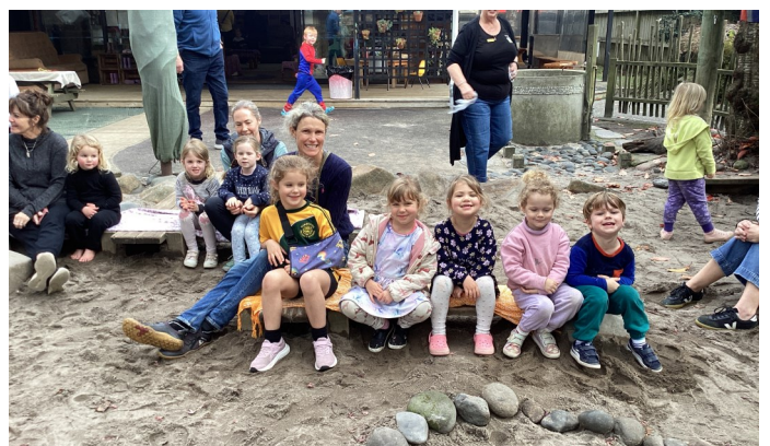
Our recent Matariki afternoon